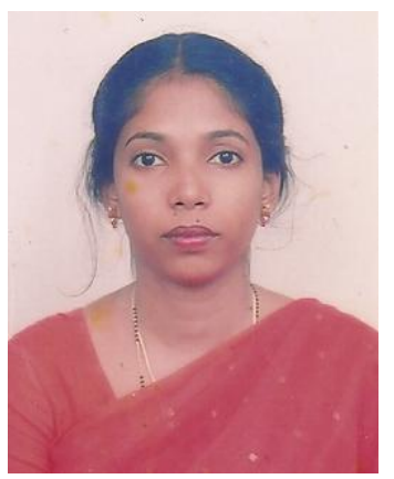
Article Info: Article Received:02/12/2013 Revised on:12/2/2014 Accepted for Publication:14/02/2014