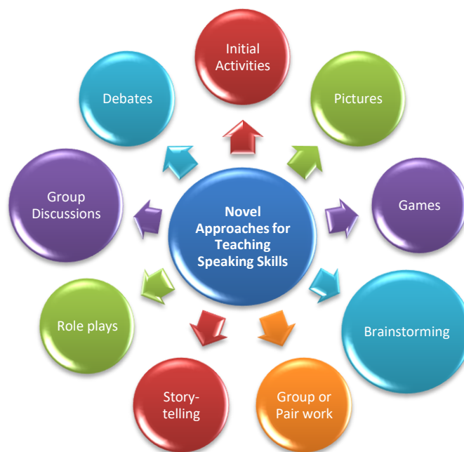
Figure: Novel Approaches for Teaching Speaking Skills

more interest among the learners. In this regard, the teachers should select appropriate materials that involve the learners more in speaking activities. Thus, the teachers think of alternative methods of teaching speaking skills which encourage the learners to participate in the activities actively in pairs or groups. So, the EFL/ESL learners share their thoughts and ideas with their peers and develop their knowledge and self-confidence that play a vital role in developing the learners' speaking skills. In this connection, the responsibility is on the shoulders of the English teachers to mould the learners to acquire necessary skills to improve their oral communication immensely by applying several novel techniques and approaches of teaching speaking skills in the EFL/ESL classrooms.