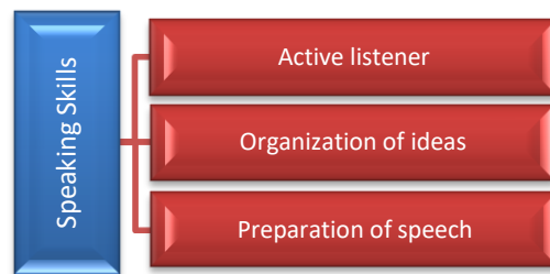
Figure: Techniques of involving the ELLs more on Speaking Skills

Since speaking skills need more time and practice to acquire, the teachers of English should teach speaking skills to the ELLs in a systematic way. Furthermore, the learners should also pay more attention towards their teachers in order to grasp a variety of sentence structures and some new vocabulary that are needed for this purpose. In this regard, the EFL/ESL teachers have to adopt various techniques of teaching speaking skills such as to prepare their learners as active listeners, teaching various strategies of organizing their ideas and also teach them the techniques of preparing the ELLs to inculcate good speaking skills among them.