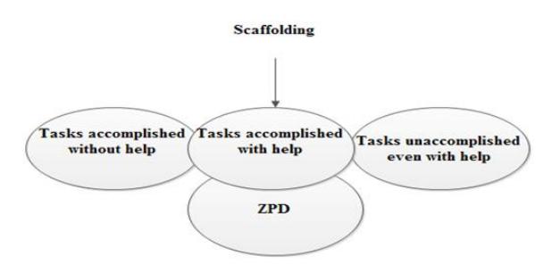
Figure 2: Scaffolding and ZPD (adapted from Campbell, 2008; cited in Shabani et al, 2010)

Crucially, the more knowledgeable other, a teacher or a more capable peer, helps the learners acquire what is not yet within their reach through interacting with them within the limits of their ZPDs. Such assistance offered by more capable others bridges the gap between the learners' developmental level and functions not internalized. Social interaction is, therefore, the scaffold that leads to the internalization of knowledge beyond the learners' grasp. The following figure illustrates how scaffolding works within the ZPD: