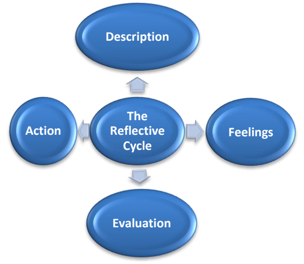
FIG.2. REFLECTIVE CYCLE