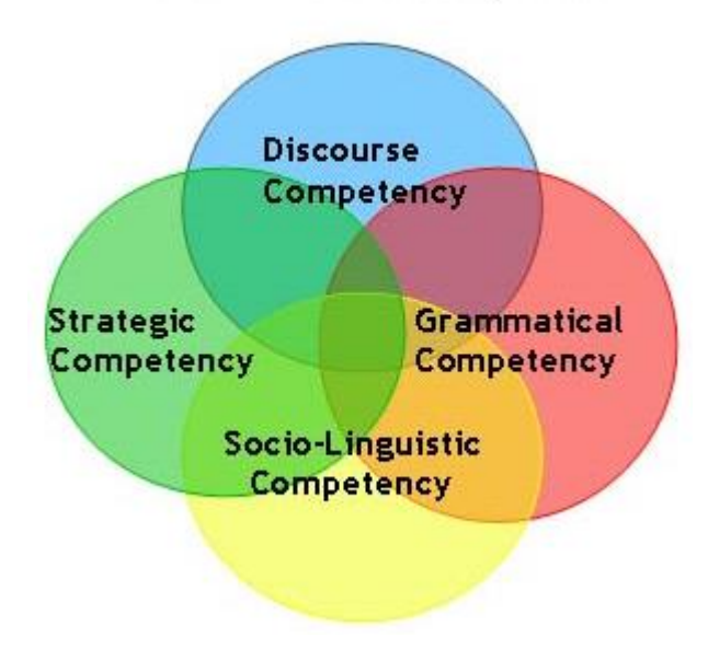
Fig.4: COMMUNICATIVE COMPETENCE 6. TEACHER AS A PARTICIPANT IN LANGUAGE LEARNING TASK

The must provide daily time for students to practice their reading skills and by allowing them to read books of their own choosing and at their own pace and for their own purposes. A good teacher therefore understands the importance of providing a variety of reading activities and greater access to books so that the students can derive satisfaction and pleasure there by stimulating more reading. Hence the teacher needs to motivate students by emphasizing not only on individual words but also should try to generate their own ideas to create their own knowledge which helps for the development of language learning.