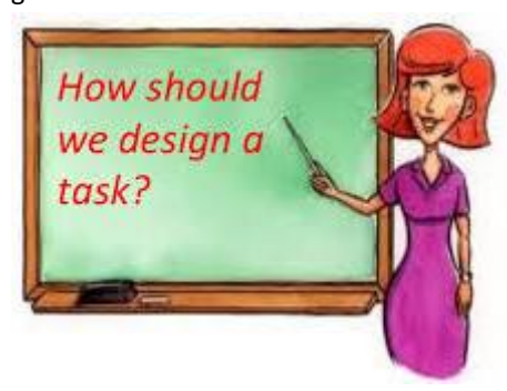
Fig.5: CREATING TASK

because it helps with the natural development of language, including listening, speaking, reading and writing.