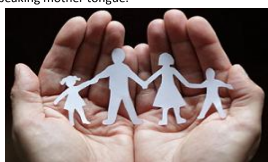
Fig. 3: PARENTAL CONCERNS

Men and women who cannot comprehend and interpret instructions in English even if educated are unemployable. They cannot help with their children school homework every day or decide their income options of the future. The fact that though they are taught in English schools they do not get the appropriate environment to practice it at their home because students like to speak in their mother tongue rather than speaking in English. Parents should focus and see their children to speak in English language by encouraging them to acquire fluency and proficiency in English language than speaking mother tongue.