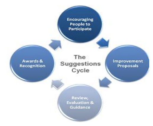
Fig. 2: SUGGESTIONS

Exposure to the real language: learning to communicate in a globalised world although a key component in English language teaching programs, English text books were criticized for learning authentic language. Exposing the importance of the real language to the students by providing an opportunity to discuss features of spoken and written texts. Encouraging them to practice in completing tasks in which language skills in the testing focus.